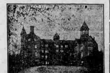
St. Helen's Hall, Portland, Or. Resident and Day School for Girls. Catalogue on Request.