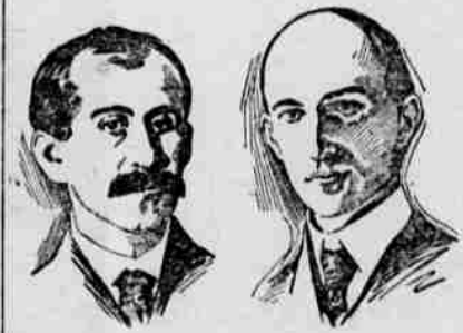
WILBUR WRIGHT. ORVILLE WRIGHT.

To the partial description of the invention given by the Wrights themselves, but one new fact is advanced, the plan by which the aviator is enabled to maintain the equilibrium of the aeroplane despite sudden and variable to maintain the equilibrium of by means of building the main planes in three sections, the center one of which is rigid while the other wings are so pivoted that a turn of a wheel at the operator's hand causes one wing to lift slightly while the other is correspondingly depressed, thereby increasing the angle of resistance in one wing and decreasing it in the other,