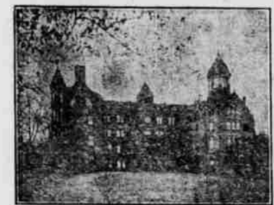
St. Helen's Hall, Portland, Or. Resident and Day School for Girls Catalogue on Request.