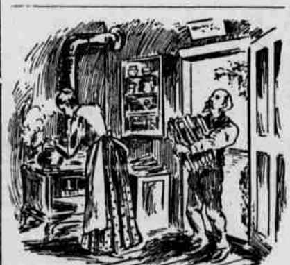
"I DO WISH SOMETHING WOULD HAPPEN."

So she bustled indoors and tied on her second-best white apron, made a