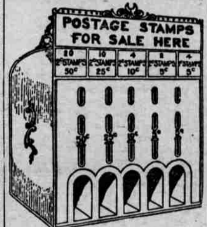
STAMP VENDING MACHINE.

A committee has been appointed by the Postmaster General to test the various stamp-vending machines recently patented for the purpose of selecting the most perfect for the use of the de-