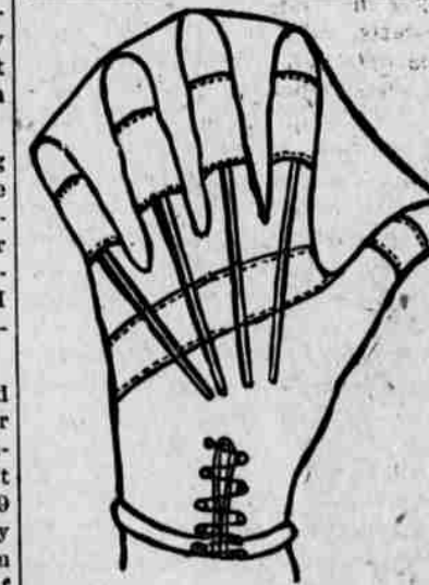
WEBBED RUBBER MITTENS.

A swimming glove to aid man in his progress through the water is a recent invention. It gives the swimmer the assistance the duck derives from his webbed feet. Greater speed and a greater distance covered, with less fatigue than with the naked hands, are claimed to be the advantages the wearer of this glove will enjoy. It fits the hands tightly and is slipped on in the ordinary way. The webs are strong pieces of cloth, running from little finger to thumb. Every stroke of the swimmer is