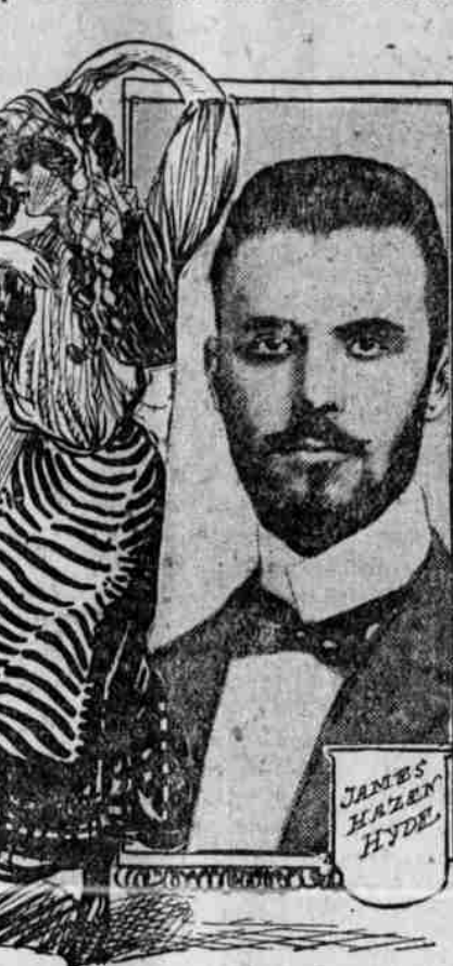
JAMES HAZEN HYDE

sions in the south of France and elsewhere. By these and other means Hyde has at this time successively blotted out, so far as Paris is concerned, the ostracism which followed his connec-