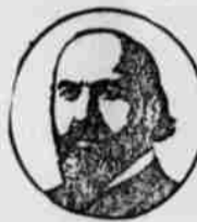
J. J. HILL.

The time for a man to retire from active business depends on conditions. Some men are young at 70, others are old at 50. The method of living, the occupation, habits, successes or failures all have their influences.