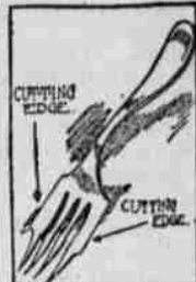
CUTS CRUSTS EASILY.

When eating pie or cake, it may taste better when held in the fingers but modern etiquette says that such