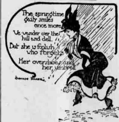
Where They Felt It.

The terms contagion and infection are too often used promiscuously, though they are by no means synonymous. The dissemination of mycotic diseases takes place in different ways. There are those which cannot be communicated from person to person, but spread only by the microbic cause invading the individual. To this class belong malarial fevers produced by spasmidia. There are, secondly, those which are not communicable from person to person, but through external carriers only, such as soil, water, food, air, clothing and utensils. To that class belong yellow fever and Asiatic cholera. They are infectious. There are, finally, those which may be transmitted directly from a person or indirectly through carriers. To this class belong scarlet fever, measles, diphtheria, variola, influenza, erysipelas and vari-cella, perhaps also whooping cough. They are contagious and infectious.