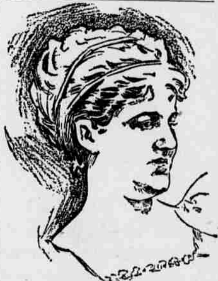
MRS. JOSEPH CHAMBERLAIN.

One of the most powerful women in the political life of Great Britain is Mrs. Joseph Chamberlain, wife of the ex-Colonial Secretary and a daughter of the late W. C. Endicott, of Salem,