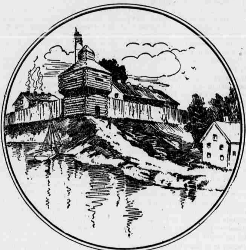
OLD FORT DEARBORN—ERECTED 1803.