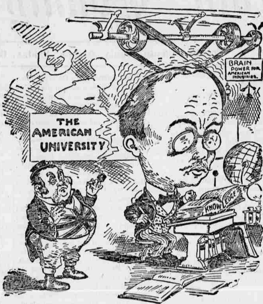
John Bull—No wonder the bloomin' Americans get ahead; look at the power plant.—Minneapolis Journal.