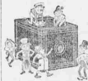
The Brownie Box, a simple, tiny package containing everything you need to get the best pictures from the Brownie Camera. Cost, 50 cents. Retail price of any Kodak dealer's or by mail.

Any school boy or girl can make good pictures with one of the Eastman Kodak Co.'s DOLLAR BROWNIE CAMERAS