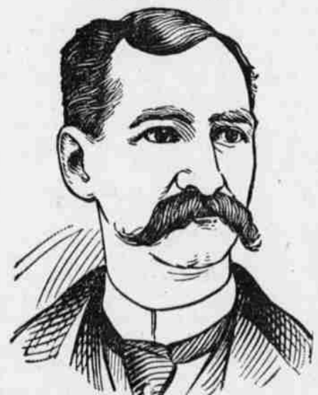
Hon. W. V. Sullivan, U. S. Senator from Mississippi.

Peruna as a Nerve and Catarrh Tonic the Talk of the World.