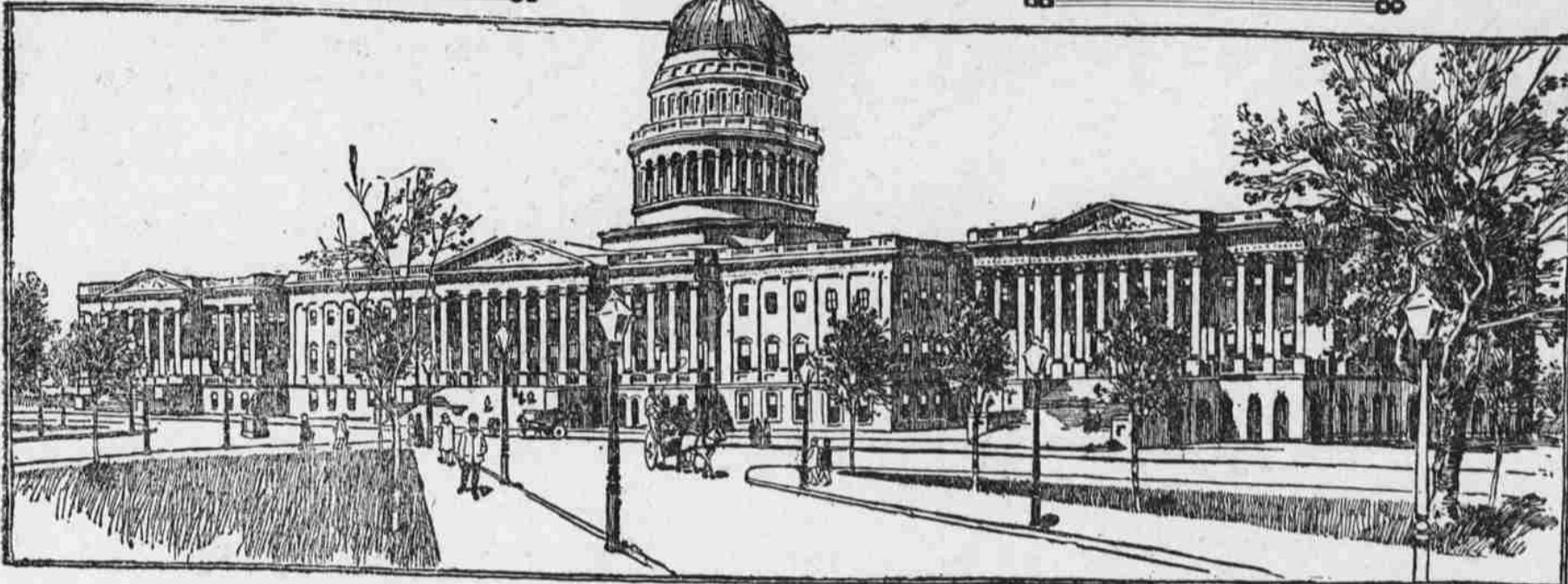
THE CAPITOL AS IT WOULD LOOK AFTER PROPOSED ALTERATIONS HAVE BEEN MADE. St. Louis Republic.

A HUNDRED years is a long time in the United States for a city to be able to record its existence, and when that city is the capital of the nation there will be scant limit to the imposing ceremonial which will inaugurate its centennial celebration in December next—the celebration which will commemorate the removal of the seat of government from the old capital of the early republic in Philadelphia to the newer site of the permanent government in Washington. Governors from every State and Territory will participate in the rejoicings. Men who are the bulwark of the nation will lend the luster of their presence and the fame of their names to the birthday celebration of the city of the government. From every section of the country will come to Washington men