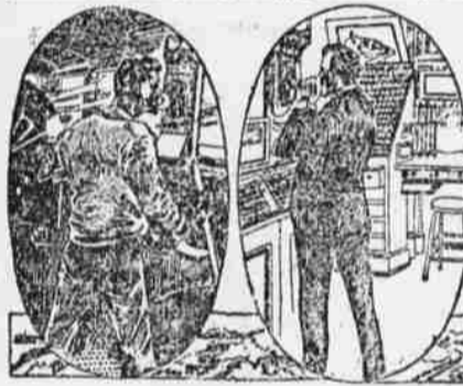
SPEAKING TO MOVING TRAIN.