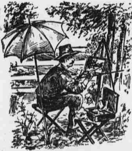
AN ARTIST WAS BUSILY WORKING.

"Trying to kill two birds with the proverbial stone," he answered lightly. "Endeavoring to earn a living and get some fresh air at the same time, and faring badly on both sides. It's too