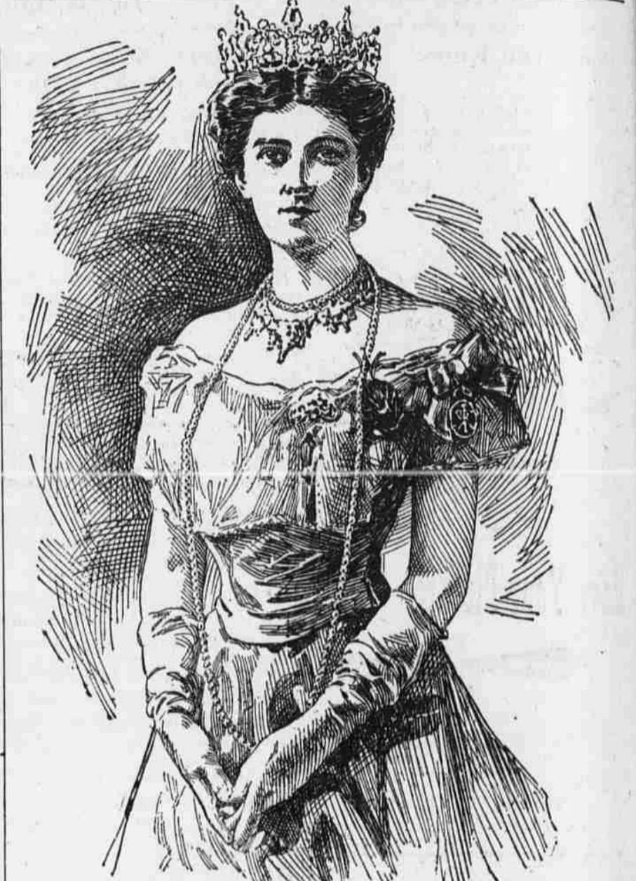
LADY CURZON, FORMERLY MISS LEITER OF CHICAGO.

The pretty, girlish creature whose beauty once captivated the marriageable men of Chicago and Washington society circles, but who married an English lord and is now vicereine of India, has just added to her list of unsought admirers the Maharajah of