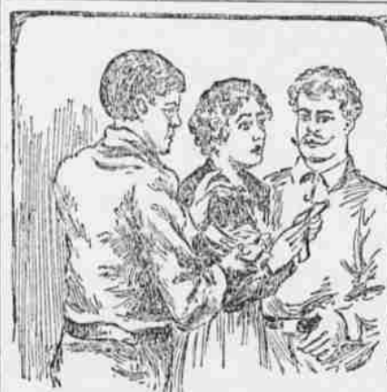
"WHAT IS HERE IS FOR YOU."