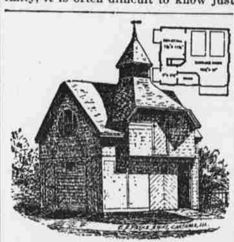
A NEAT STABLE.

A well-planned and carefully constructed stable as an adjunct to a handsome residence is often the exception In Japan fashion compels married instead of the rule. In situations where the stable and house are seen at the same time the former should match the latter and be in every way in the same general style. It ought to be a picturesque, pleasing design, adding to the charm of the landscape. When a nice house is erected and it is necessary to have a private stable in close proximity, it is often difficult to know just