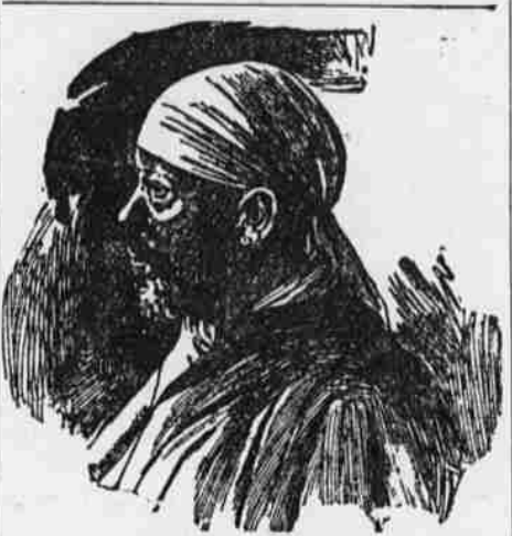
KING MENELIK II.

His chief pride naturally is in his well organized and disciplined army, a large part of which is composed of women. Here it is that his masterful genius as a soldier finds play, and it has been worked almost to a state of absolute perfection in discipline. In the last few years he has invited German and Russian military instructors to aid him in the work, supplementing his own prac-