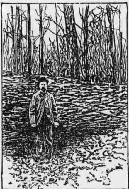
MONSTROUS LOG OF WALNUT.

The picture shows a section of one of the black walnut trees recently purchased by a Mishawaka, Ind., lumber company. There were fifty-one trees in the clump, located in Cass County, Michigan, and the price paid was $10,000 in cash. The section shown in the