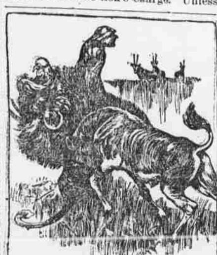
FATAL TO BOTH

"African hunters have often seen antelopes grazing in full sight of a lion and making no effort to get away, knowing that their flight would be swifter than the lion's charge. Unless