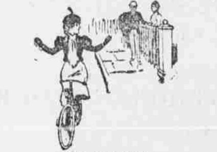
She Rides Well.