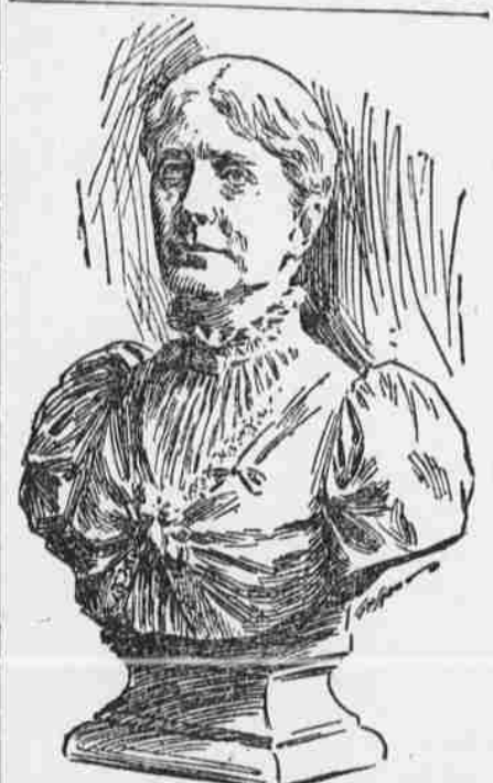
BUST OF FRANCES E. WILLARD.