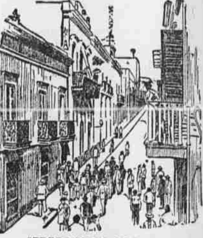
STREET SCENE IN SAN JUAN.

The ground floors of the whole town reek with filth, and conditions are most unsanitary. There is no running water