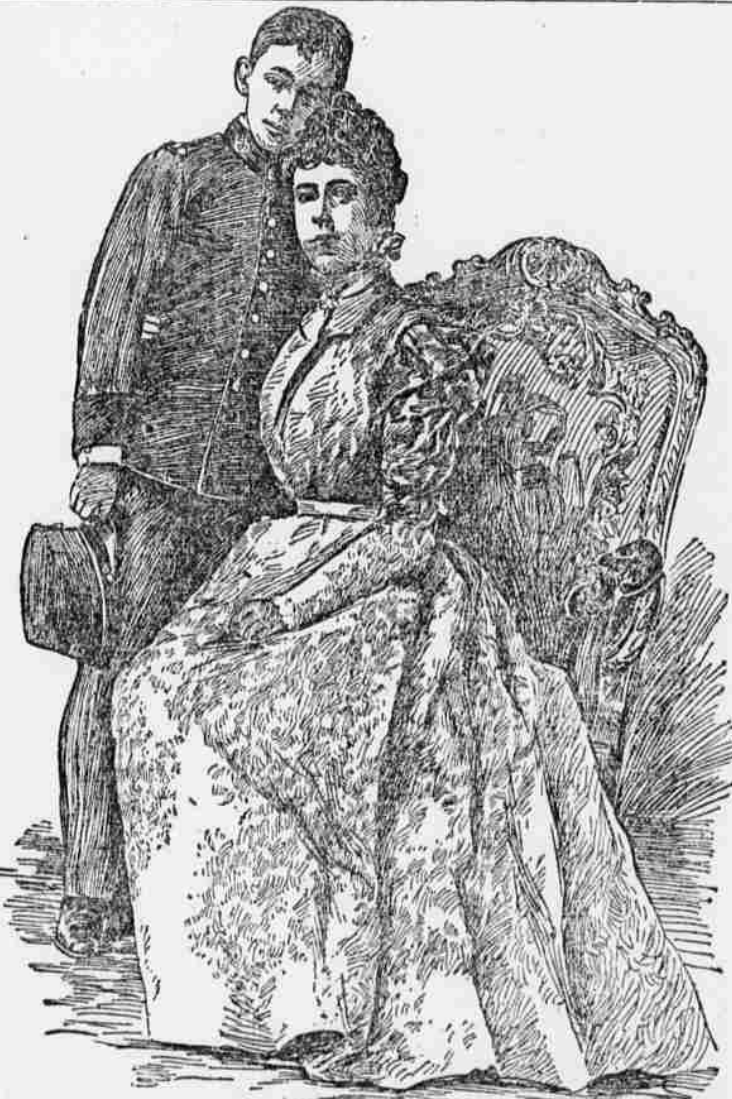
THE QUEEN REGENT OF SPAIN AND ALFONSO XIII.

Queen Christina leads a very busy, anxious life, and is one of the hardest workers in Europe. The Queen does not often relax from her usual regal demeanor, but when she does she is perfectly charming, with a keen sense of humor and an almost girlish delight in