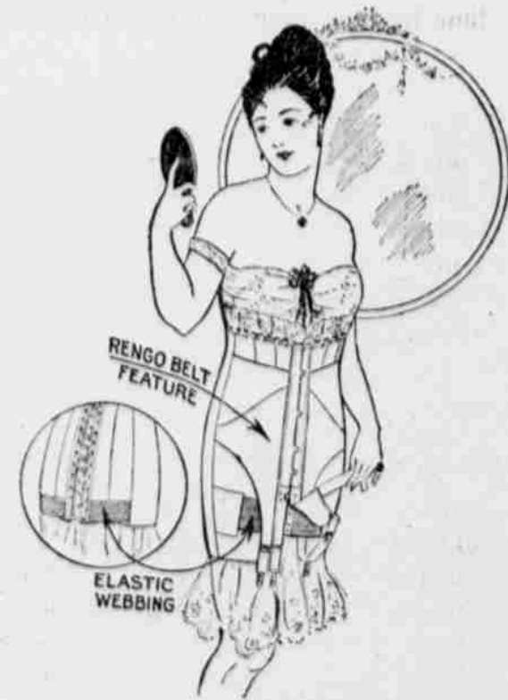
LADIES CORSETS, NONE BETTER, FEW AS GOOD

56 inch Round Thread Linen ..... .49c 36 inch Linen ..... .69c 36 inch, Plain Linen ..... .29c 27 inch Plain Linen ..... .15c 27 inch Plain Linen ..... .18c 36 inch White Linene ..... .15c Linene, Blue and Tan ..... .12 1/2c