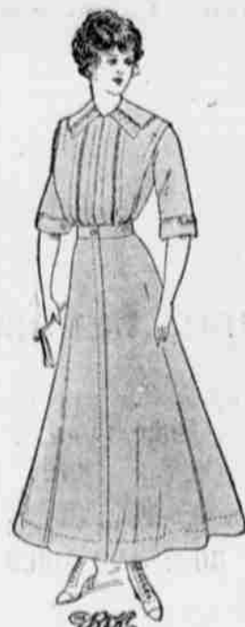
B. K. HOUSE DRESSES

Examine these closely, look at the workmanship as well as the material—They are dandies, worth half the price more ..... .98c Bungalow Aprons at money saving prices ..... .39c—49c