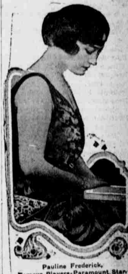
Pauline Frederick, Famous Players-Paramount Star.