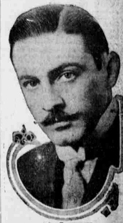
John Barrymore, Famous Players-Paramount Star.