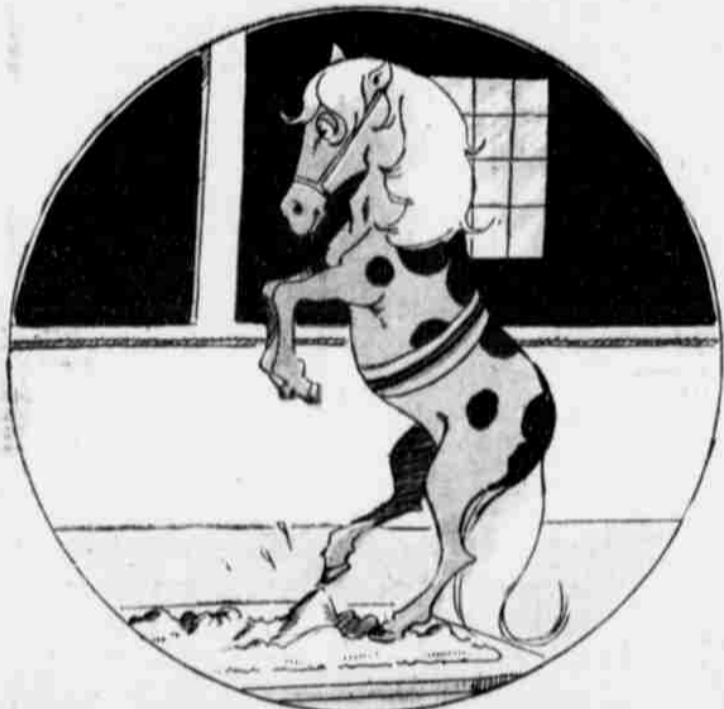
I thought it could stand a few more valleys, so I took a hand in it, or rather, a foot—