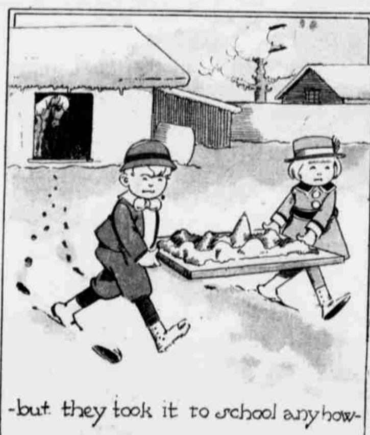
—but they took it to school anyhow—