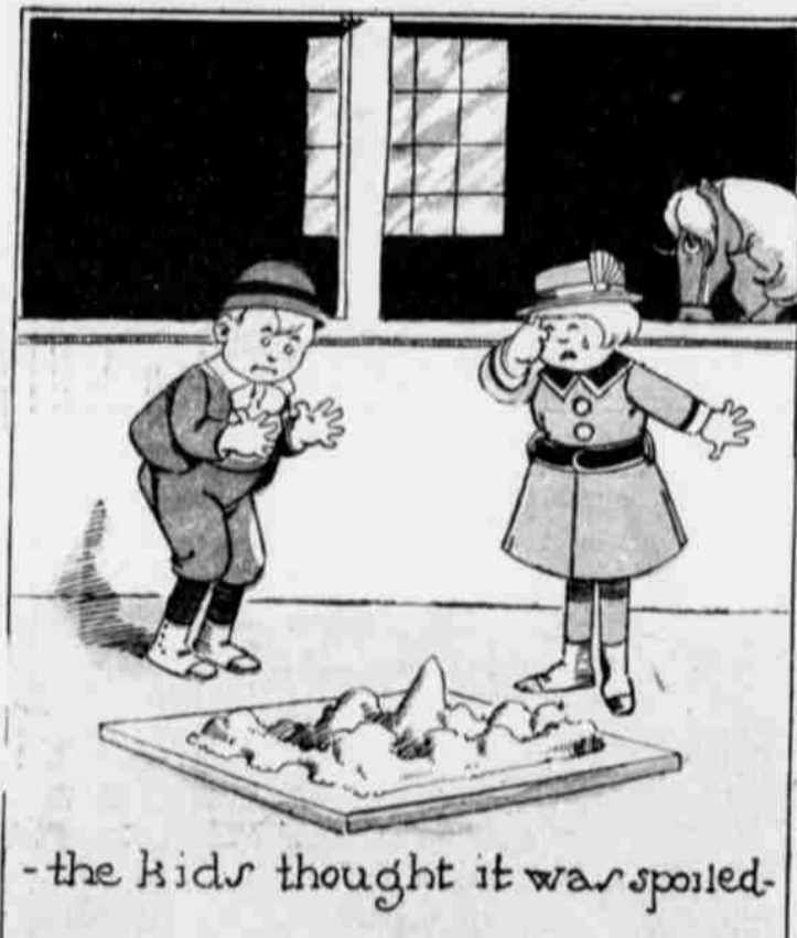
—the kids thought it was spoiled—