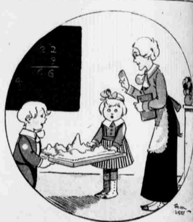
—and teacher said it was the best in the room!!