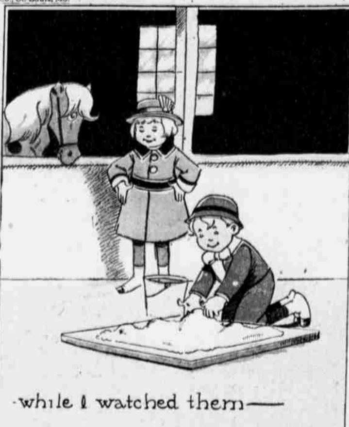
—while I watched them—