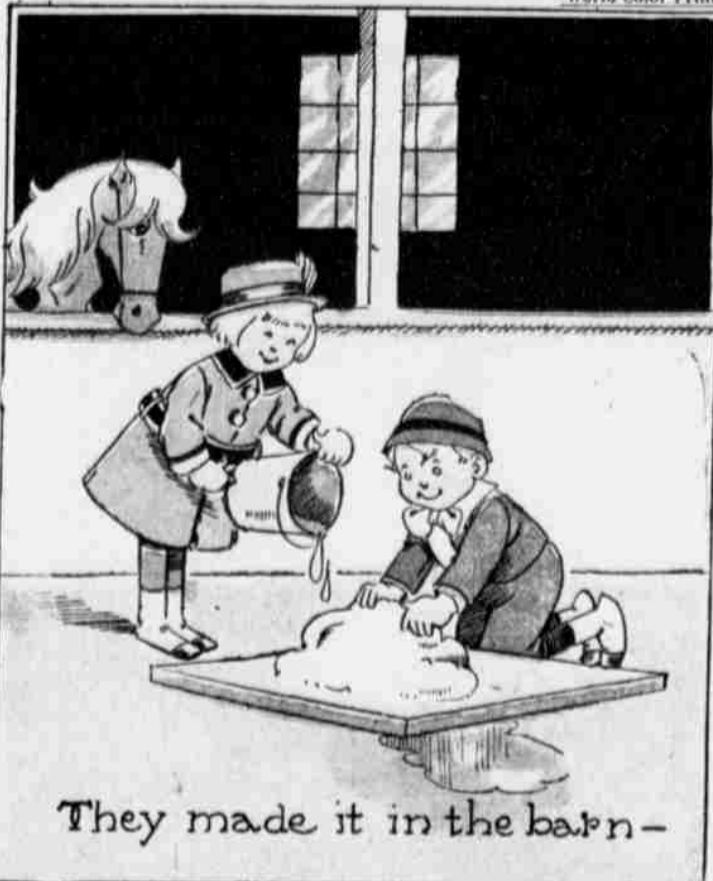
They made it in the barn—

World Color Printing Co., St. Louis, Mo.