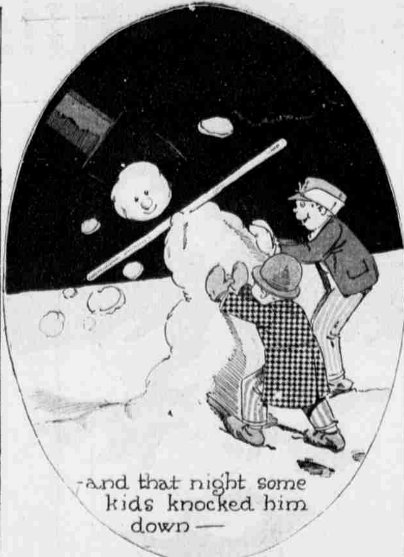
and that night some kids knocked him down—