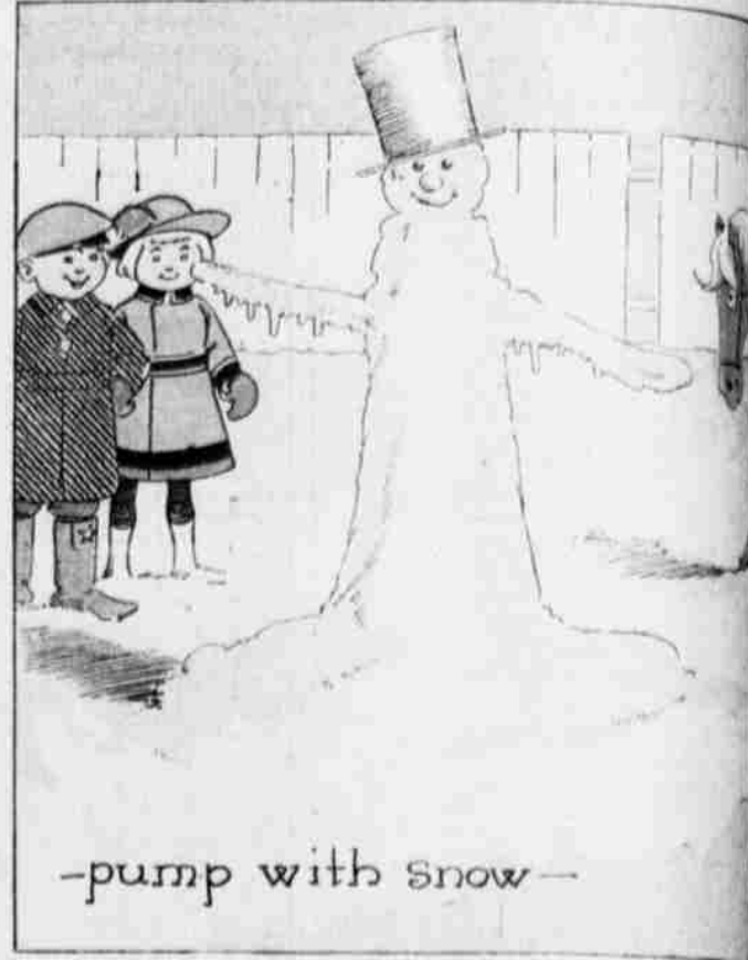
—pump with snow—