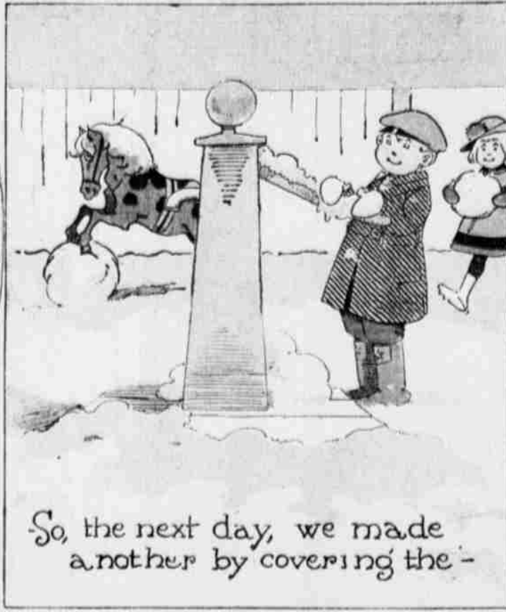
So, the next day, we made another by covering the—