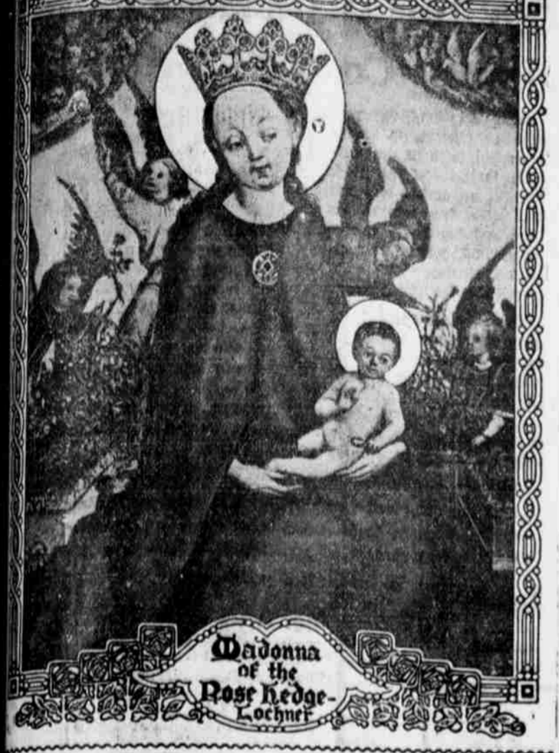
Madonna of the Rose Hedge—Lochner