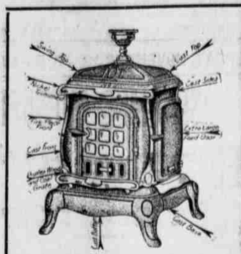
This cut shows the construction of the Duplex Heater. Note the special features. Not new features with which we are experimenting but features that have made this Heater a reputation which cannot be denied.

Our heaters are particularly adapted for your use. Every heater we sell carries a double guarantee. The guarantee of the maker as well as our own. Our heaters are the best made, the most economical and finest appearing heaters you have ever looked-at. Come in and select the style you have in mind.