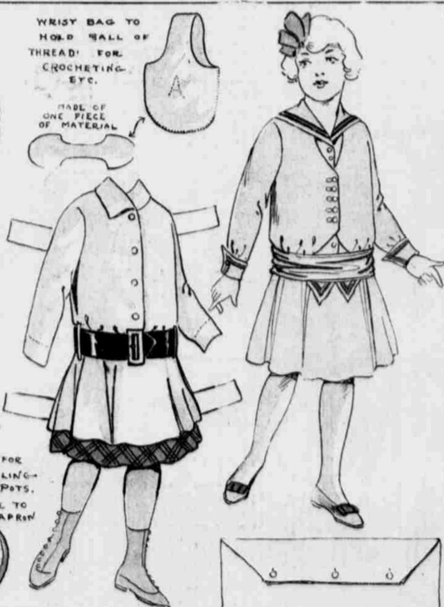
ENVELOPE CASE FOR DOILIES ETC.