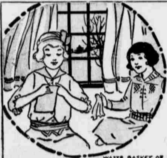
WASTE BASKET OF BURNED CARDBOARD - RIBBON