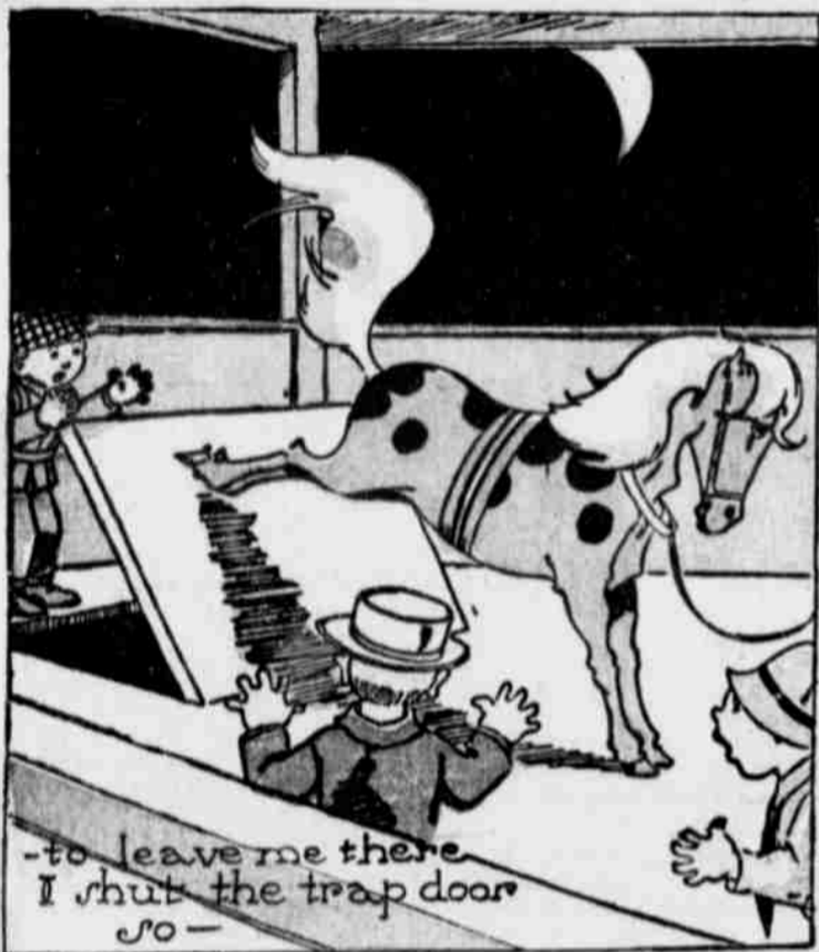
-to leave me there I shut the trap door so -