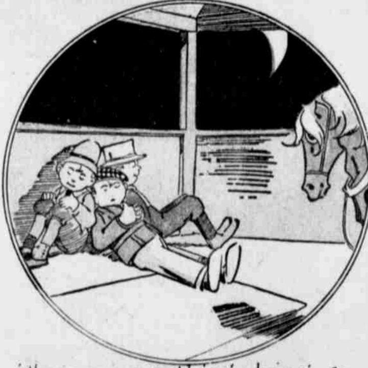
-there was nothing doing, so they went to sleep in disgust - and we caused quite a stir when folk woke up the next -