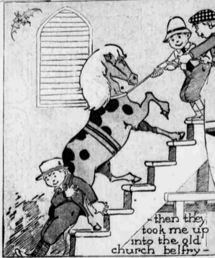
then they took me up into the old church belfry -