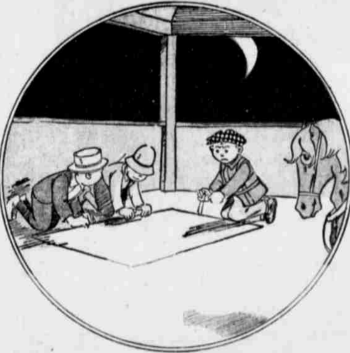
-we all had to stay. The boys broke all their knife blades trying to open the door, but -