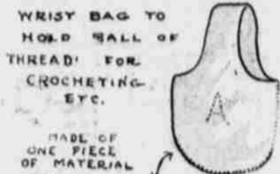
WRIST BAG TO HOLD BALL OF THREAD FOR CROCHETING ETC.