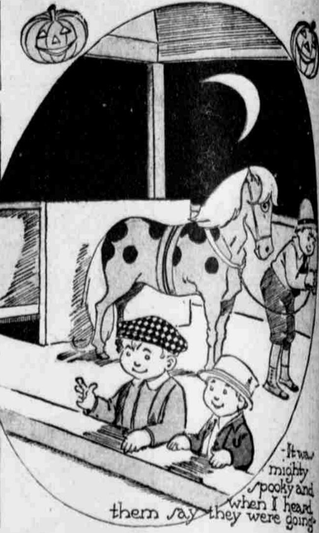
It was mighty spooky and when I heard them say they were going -