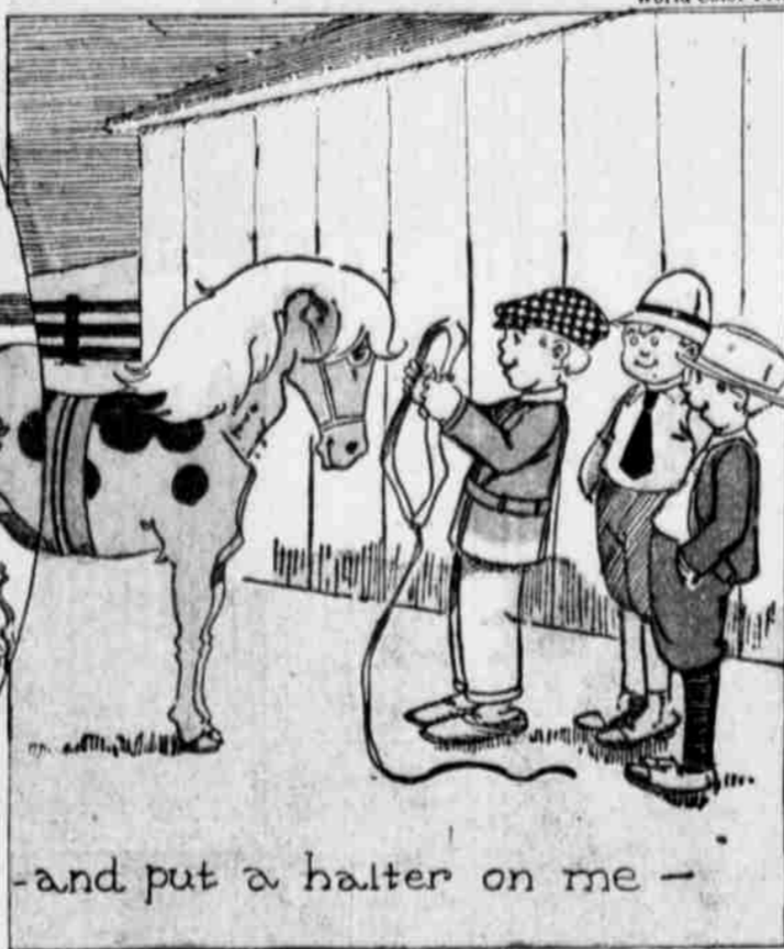
-and put a halter on me -