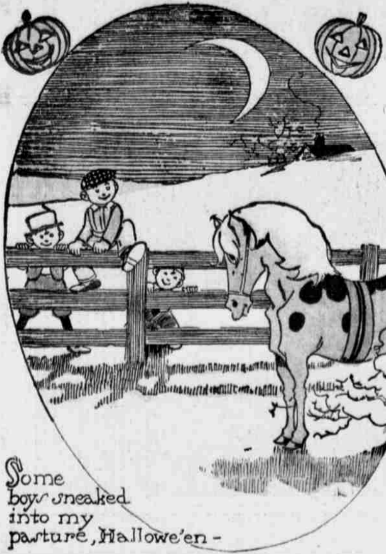
Some boys sneaked into my pasture, Hallowe'en -

World Color Printing Co., St. Louis, Mo.