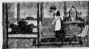
Dust in the Bed Room