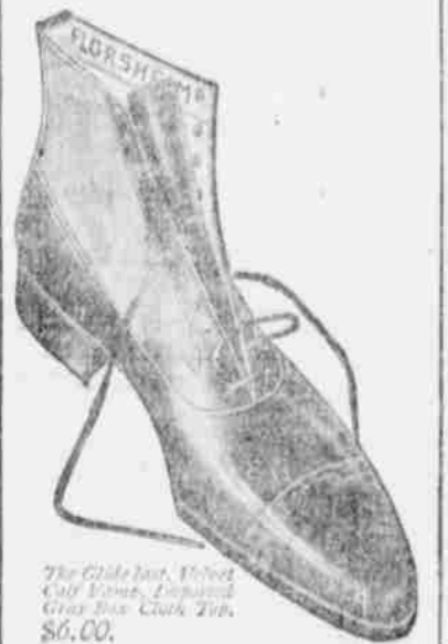
The Gable Last, Patent Golf Shoes, Improved Coos Bay Club Type, $6.00.

will be your remark when you see the new shapes and patterns we're showing in men's $5 to $7 footwear.