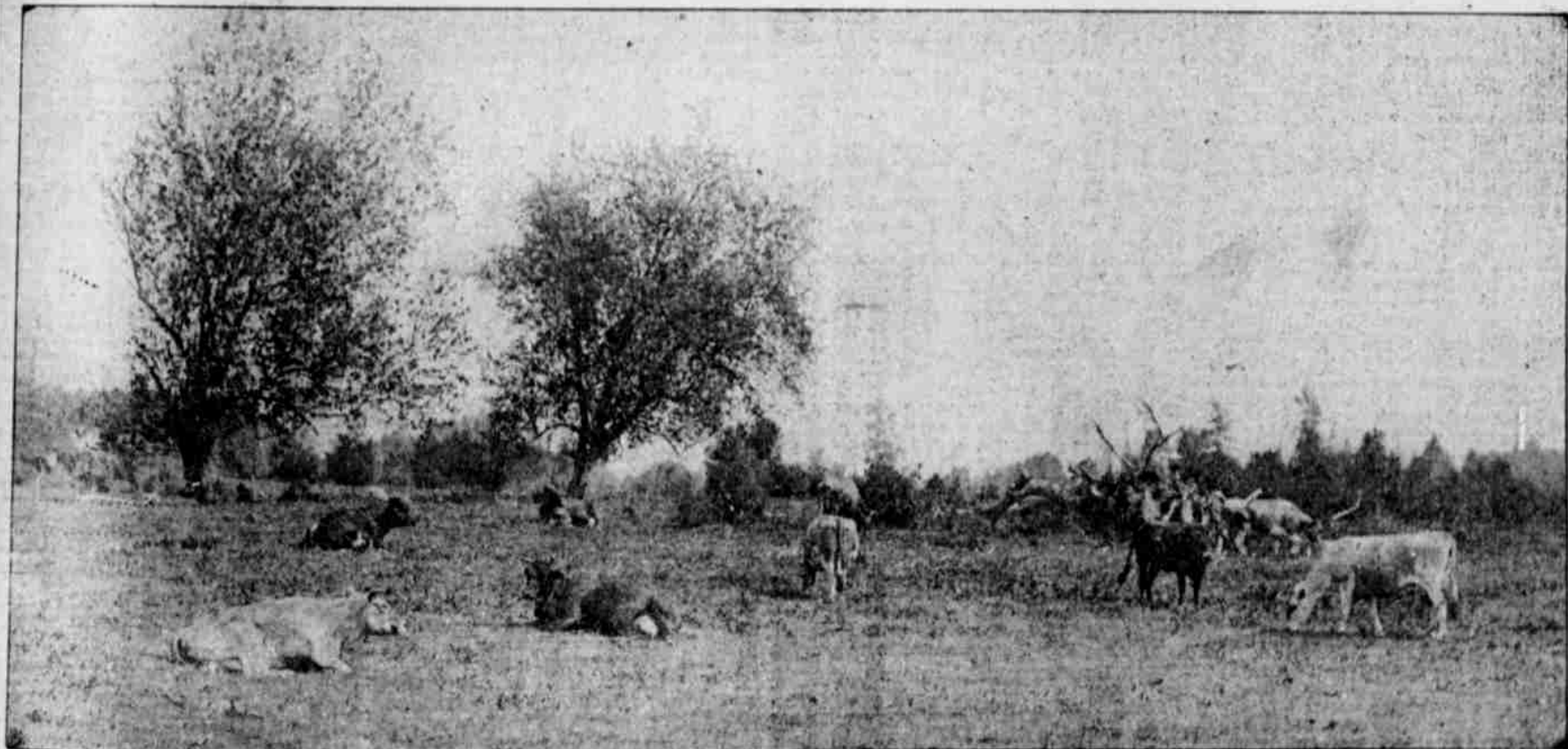
PLEASANT PASTURE LANDS IN EASTERN OREGON

The Pacific Northwest is rapidly acquiring some of the finest highways in the United States. Good roads shorten the distance to the market for the farmers and enhance the value of the lands they traverse. Multnomah County, Oregon, voted for good roads April 14, when a majority of nearly 14,000 people authorized an issue of $1,250,000 in bonds to pay for improving 70 miles of the county's principal trunk highways with modern hard-surface pavement for permanent use. This in a year of so-called "business depression."