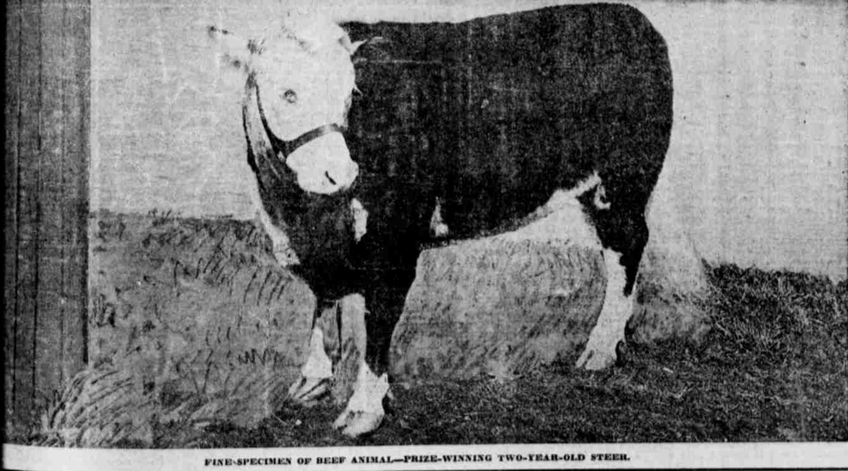
FINE SPECIMEN OF BEEF ANIMAL—PRIZE-WINNING TWO-YEAR-OLD STEER.

Residence Phone 13-J. Market ave. and Waterfront