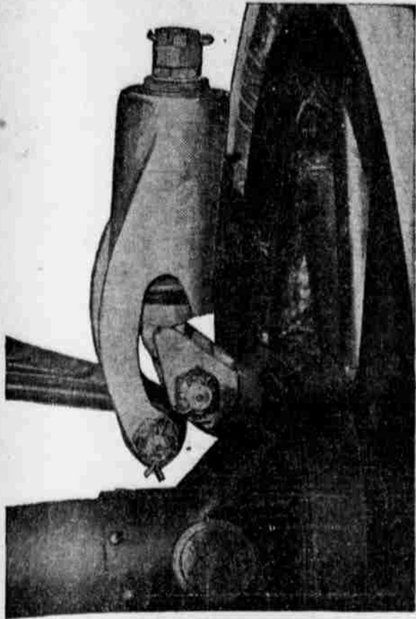
PREVENT SPRING BREAKAGE