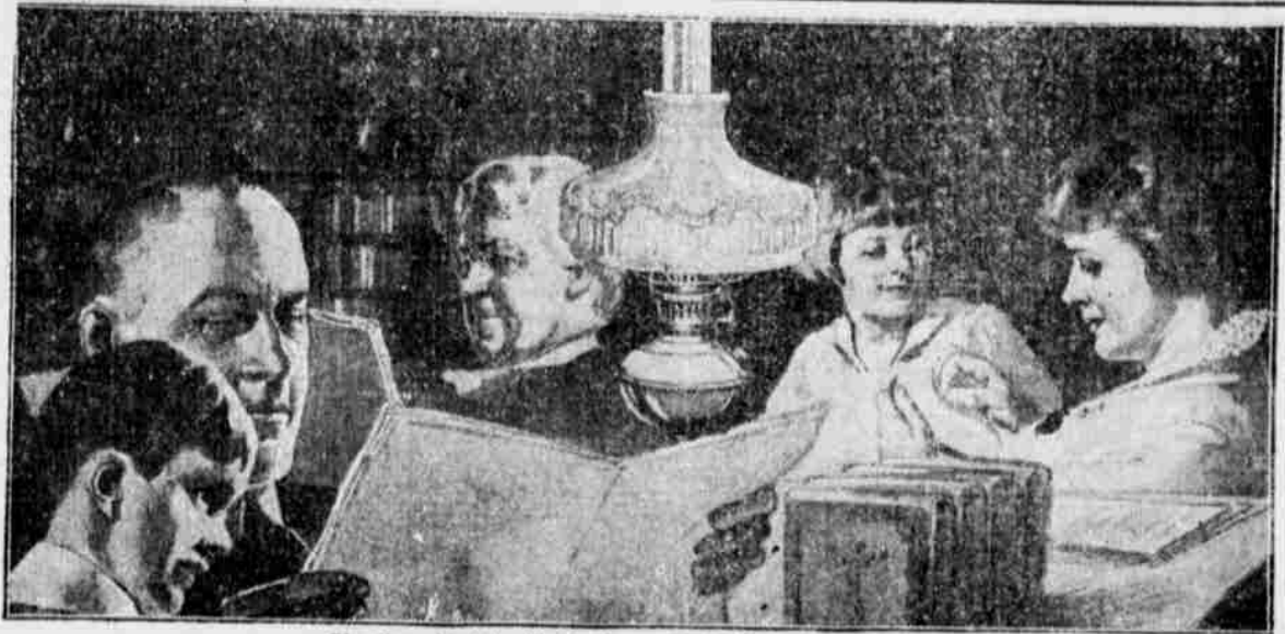
Showing Aladdin Table Lamp Style (101-A) in Use —There's an Aladdin style for every place and purpose.

Better than Electric—But Uses Less Oil than an Old Style Lamp.