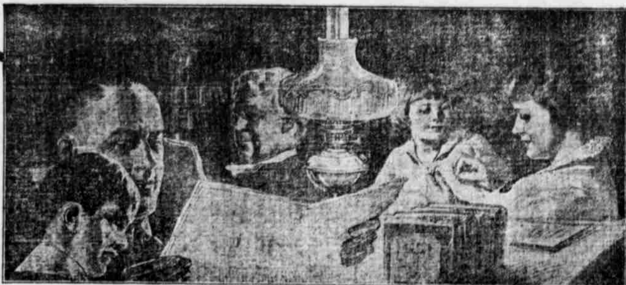
Showing Aladdin Table Lamp Style (101-A) in Use —There's an Aladdin style for every place and purpose.

Better than Electric—But Uses Less Oil than an Old Style Lamp