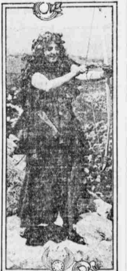
MARGARITA FISCHER, the BEAUTY-MUTUAL STAR.

Margarita Fischer, star of the Beauty-Mutual motion pictures, usually is seen in evening garb or fashionable morning or afternoon attire. She is so very pretty that her personality is associated with the delicate things of life rather than its rigors. But she has a habit of doing the unexpected and doing it so well that one suspects that, after all, it is just what one had expected.