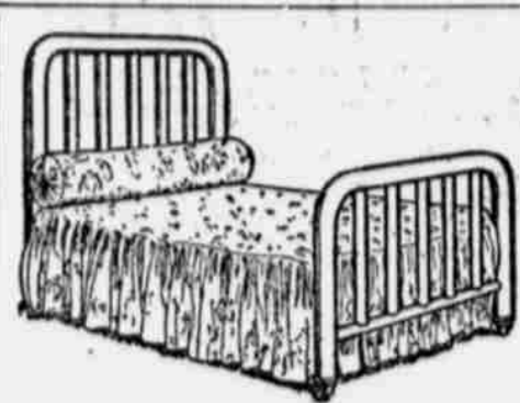
Brass Beds, guaranteed for five years against tarnishing, A High Quality Bed—$18.00

Just to Show You One Example of Economy at Our Store