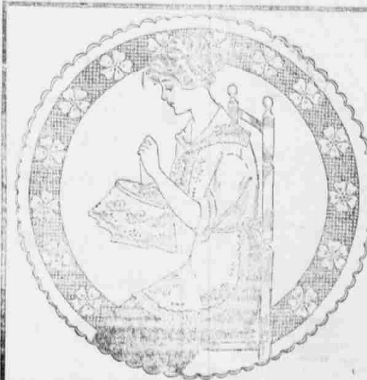
A Touch of Embroidery Adds Refinement to Every Garment