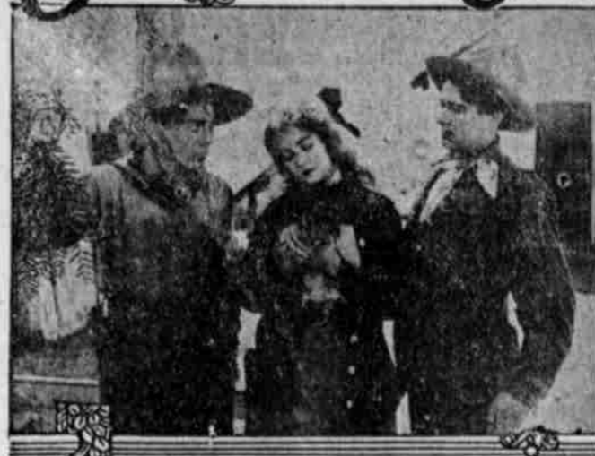
"THE MYSTERIOUS SHOT."