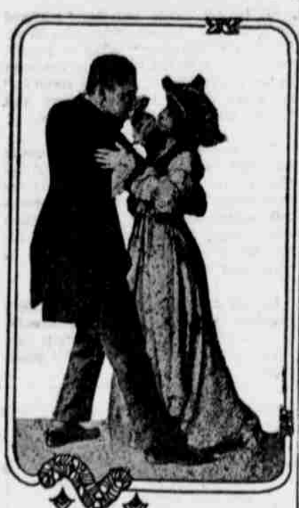
CORRECT POSITION FOR START OF THE

the right foot over till it souches the left heel. Raise the left foot at mement of contact and step back on it. Take another step back on right foot and bring left over till feet touch. From this position raise the right feet and continue with original step. This is the full corde. After learning the rotation of the foot positions try and get a little enap into the last step. That is when you bring the feet together at the end of the forward and backward steps. The two long steps should be done slewly, and the drag should take the form of a slight stamp such as the Spaniards do in their folk dances. The girl is going in the op-posite direction all of the time.