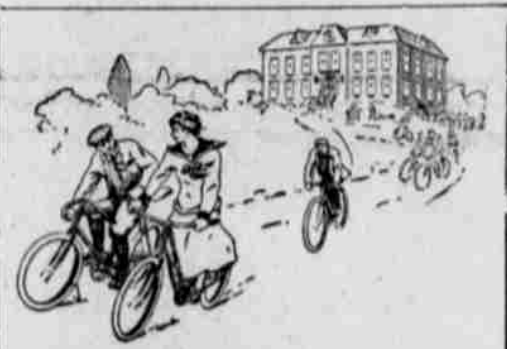
FIRST HOME FROM SCHOOL