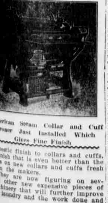
American Steam Collar and Cuff Ironer Just Installed Which Gives Fine Finish

CORNER CENTRAL AVENUE AND BROADWAY. PHONE 361.