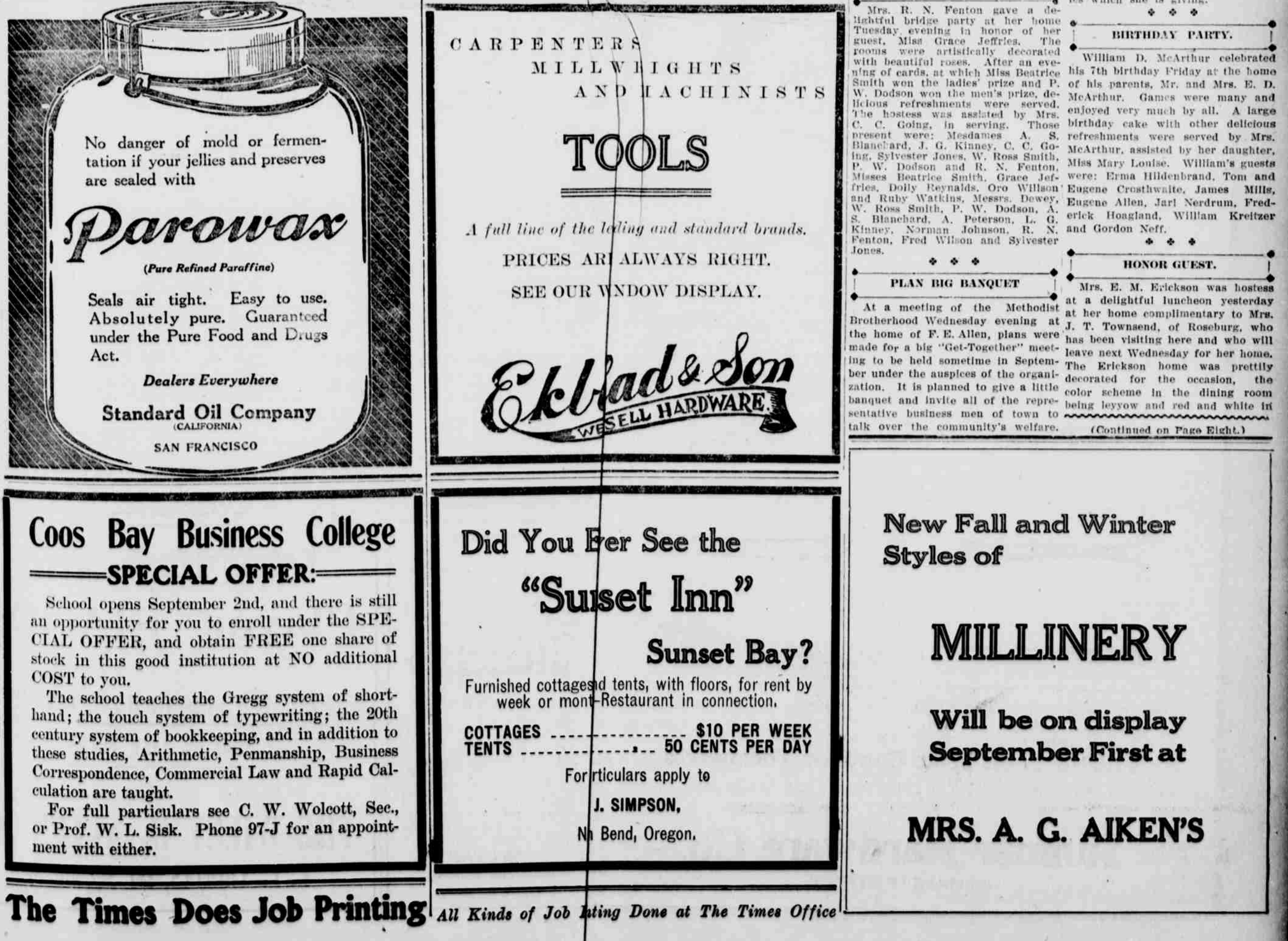
Everything to Wear