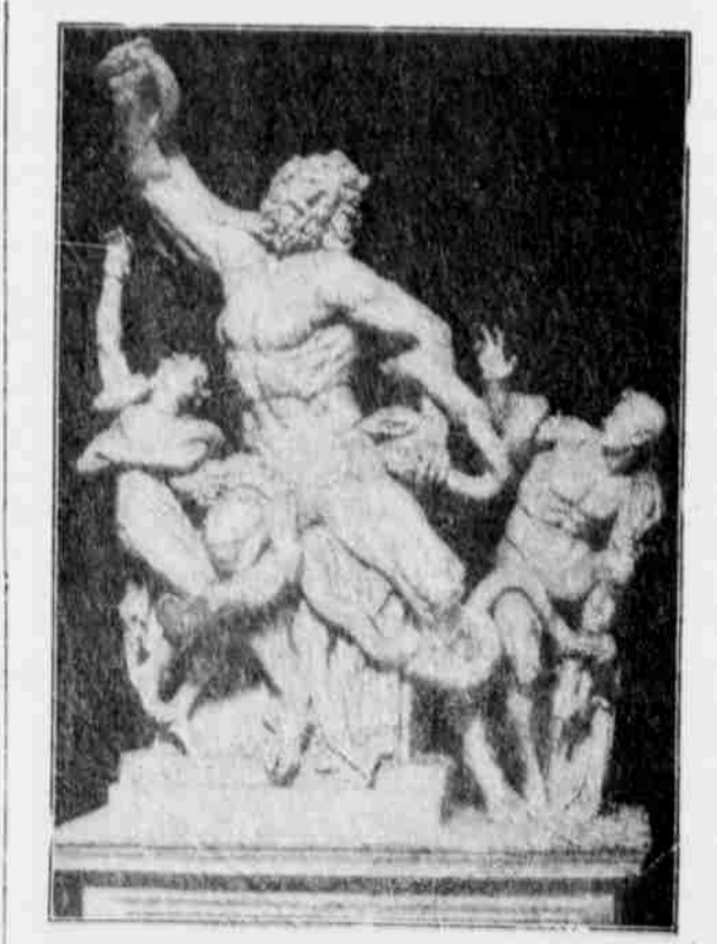
THE LAOCOON GROUP This is one of "Six Statues With a Story," which Lordo Taft, the celebrated sculptor, describes in an early number of The Mentor. The stories are fascinating, and cover the Laocoon, Dying Gladiator, Perseus, and other great classic statues in a new and captivating way.