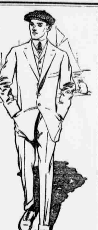
Popyright Hart Schaffour & Mars

KEEP ADVERTISING AND ADVERTISING WILL KEEP