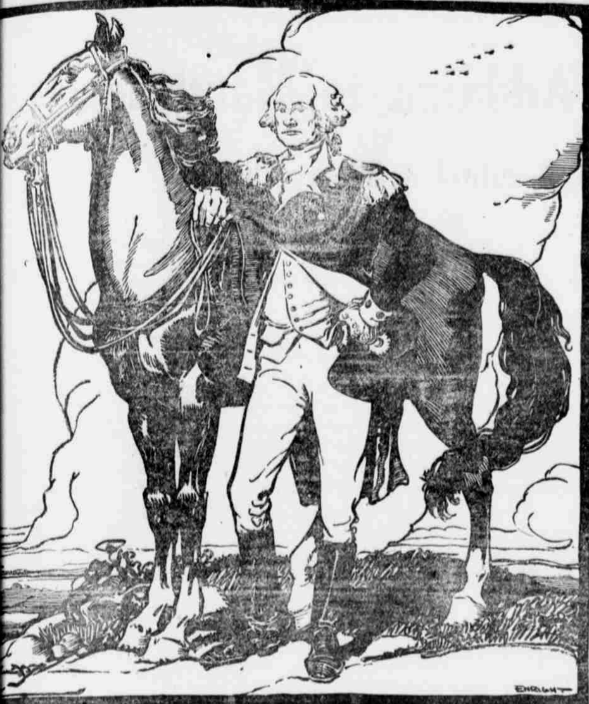
George Washington's Birthday, February 22nd

It's a good thing for all of us, at certain times, to pay honor to the Nation's great men. We want our young people to feel the inspiration of such patriotism and devotion to great ideals as these men showed.